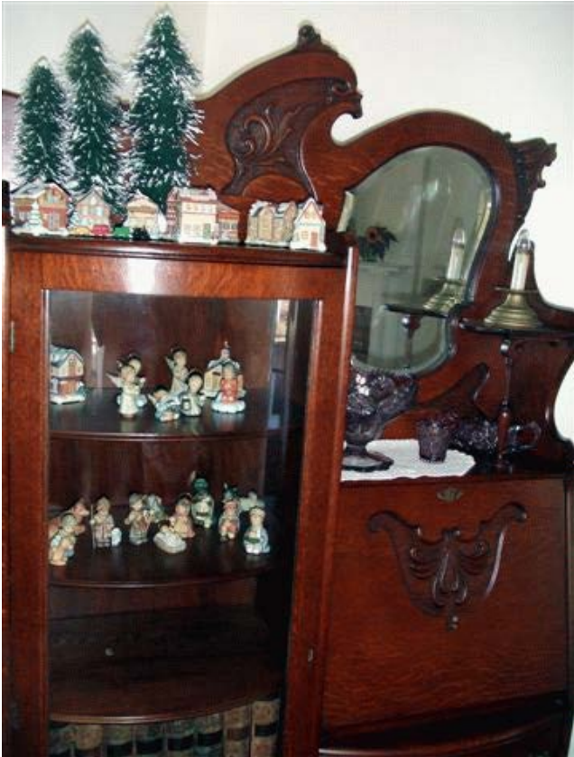
Collectibles on loan from Pat Petrovich