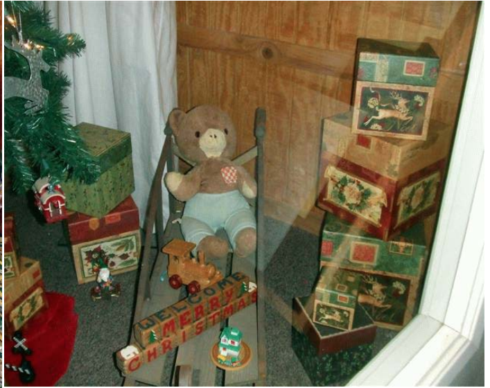
Toys in main display case