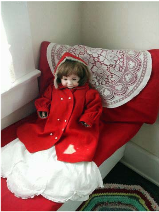
Ready for the holidays